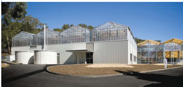
University of Adelaide Plant Accelerator Facility.