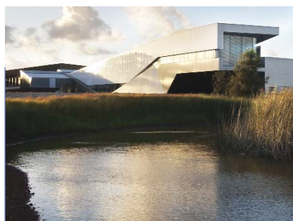
UniSA Mawson Institute .